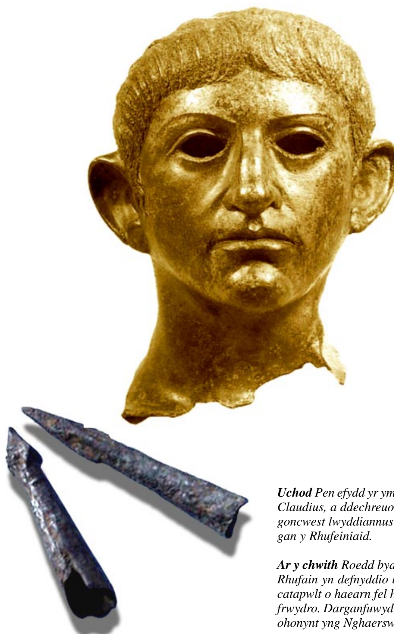
Uchod Pen efydd yr ymerawdwr Claudius, a ddechreuodd goncwest lwyddiannus Prydain gan y Rhufeiniaid.

looking at temporary camps or 'marching camps'. The size of these camps, which vary from about 1 hectare to over 20 hectares in size, tell us about the size of the fighting forces and the routes they took.