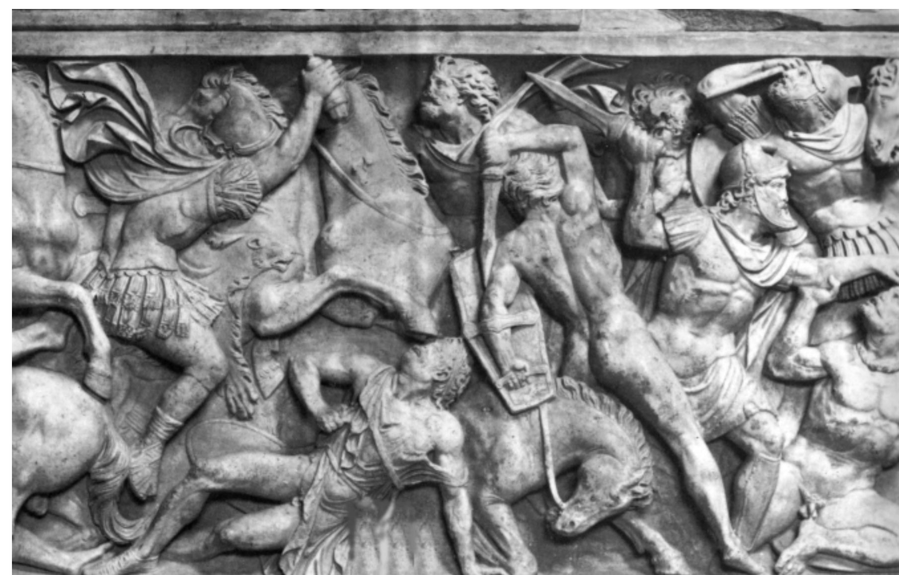
Llengfilwyr a milwyr Cynorthwyol oedd ym myddin Rhufain. Roedd tua 5,000 o ddynion ym mhob lleng, troedfilwyr yn bennaf, a oedd yn ddinasyddion Rhufain ac wedi gwasanaethu hyd at 25 mlynedd. Roedd tua 500 o ddynion yn yr unedau cynorthwyol, a oedd yn helpu'r llengoedd. Byddai'r dynion hyn hefyd yn gwasanaethu am hyd at 25 mlynedd ond ni fyddent yn dod yn ddinasyddion hyd nes iddynt ymddeol. Roedd yna wahanol fathau o unedau cynorthwyol, gan gynnwys marchfilwyr a milwyr troed a fyddai'n ymladd â chleddyfau, gwaywyffyn neu fwâu.

The Roman army was made up of Legionary and Auxiliary soldiers. Each legion had about 5,000 men, mostly infantry, who were Roman citizens and who served up to 25 years. The auxiliary units, which helped the legions, had about 500 men who also served 25 years and only became citizens once they retired. There were different kinds of auxiliary units including cavalry and foot soldiers who fought with swords, spears or bows.