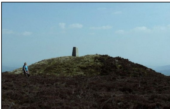
The Bronze Age barrow on the summit of Bache Hill

Return to the track, noting a third burial mound on the skyline to the north-east which will be visited later. Unfortunately, the intervening fields have no public access. Turn left and follow the track to the north-west. On reaching a junction of boundaries at a saddle (SO 20546381) cross the first stile on the right, next to a gate, and turn right alongside a pond to follow the edge of the forestry. Go through the gate at the far end of the field and turn right, leaving the bridleway, to follow the fenceline southwards.