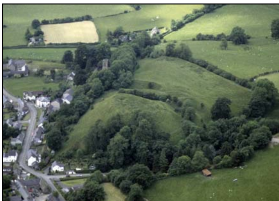
Aerial view of New Radnor Castle

From Broad Street walk uphill to the junction with High Street and turn left, then taking a lane on the right, rising behind the War Memorial, which leads to the St Mary's Church 1 , which was built in 1845. Continue along the south side of the church and through a gate leading to New Radnor Castle 2 .