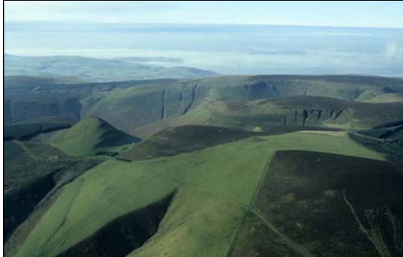
Aerial view of Bache Hill and Whinyard Rocks with the Whimble to the left

Take the track on the left, around the edge of the forestry, leading to a gate into a field, from where the path follows the forest edge. As the ground levels at the end of the forestry, continue along the track which starts to descend. Unfortunately, there is no public access to Whimble, the prominent hill which overlooks the forestry from the north. On the left is Harley Dingle which is used as a live firing range. At the end of the track (SO 20476296) go through a gate and turn right to follow another track around the base of Whinyard Rocks.