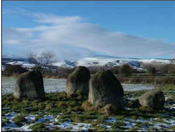
The stone circle at Four Stones

a causewayed enclosure and two cursus monuments dating to about 3,600 BC, together with two palisaded enclosures, one of which was built about 2,600 BC and enclosed 34ha, making it the largest such site in Britain. There are also a number of Bronze Age (2,300 – 1,200 BC) sites, many of which are still upstanding, including the Four Stones stone circle (SO 24576080) and numerous burial mounds. The barrows on Bache Hill are prominent landmarks which are visible on the skyline from much of the Walton Basin. More information on these remarkable sites can be found on the CPAT website: www.cpat.org.uk