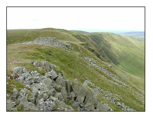
One of the burial cairns along the Berwyn ridge

Continue to a ladder stile at SJ 0487135100, cross the stream and turn L, following the path through a boggy section to a more obvious, often wet, track. On meeting a more major track go through the gate and through a second gate on the right into a field. A grassy track contours gently downhill, through two gates to meet a track which descends left through forestry. Continue through forestry and then ahead with forestry on right. Leave track at descending hairpin (SJ 0381536395) to follow path along edge of forestry which leads past Llechwedd to join a lane which returns to Llandrillo.