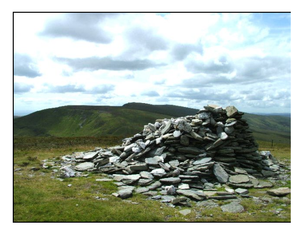
The summit of Cadair Bronwen with the Berwyn ridge behind

Return to the track and a waymark post at SJ 0467933462. An unusual triple ring cairn (10) lies immediately E of the post, with a small burial cairn 20 metres to the SW at SJ 0467933439. Continue NW to a ladder stile at SJ 0459833637. crossing the stream and heading through a gateway in the fence close to the sheepfold. The path contours N to a ladder stile at SJ 0472834264. continuing through a boggy area and heading towards a small rocky outcrop. At SJ 04734 34472 there is a small burial cairn (11) in reeds immediately right of the path.