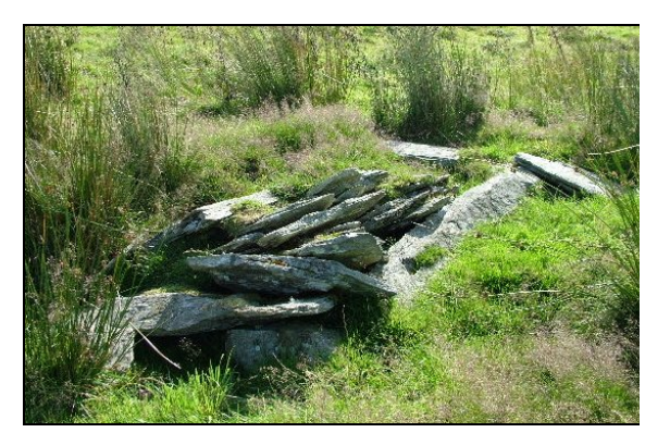
Cist below Moel Ty Uchaf

The track crosses two shallow fords and passes through four gates before reaching a crossroads with a group of conifers beyond. Turning right the walk now follows a track which linked the valleys of the Dee and Tanat, via Bwlch Maen Gwynedd. Continue through the gate and around 60 metres before reaching a gate through the fence on the right, near the end of the forestry, leave the track and turn left, directly upslope for 40m to a well-preserved stone cist (1) in a small patch of reeds at SJ 05445 37140. This is the best preserved of four such sites which are essentially small. stone-built burial