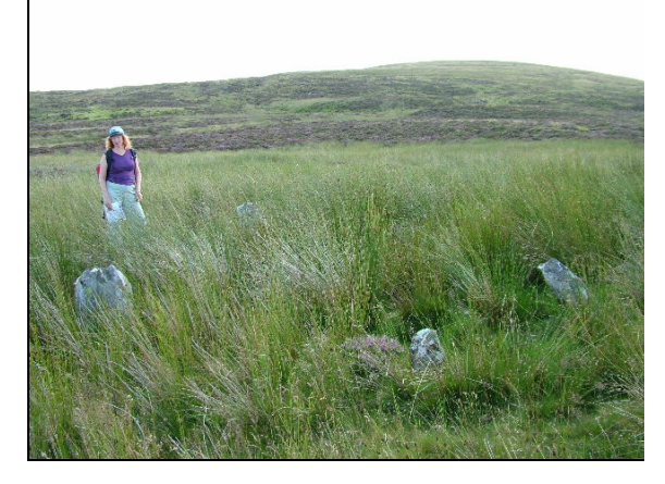
Cerrig Bwlch y Fedw stone circle

From the circle head S, downslope to a raised circular Bronze Age platform cairn (3) around 16 metres in diameter at SJ 0564537112. This low earthwork is now almost entirely covered by turf but may originally have consisted of a ring bank of stone, possibly retained by a kerb, the centre of which was later infilled with more stone to form a level, circular platform. The function of these sites is uncertain and they may have had both a ritual and burial purpose and excavated examples elsewhere have uncovered cremations sealed beneath the platform.