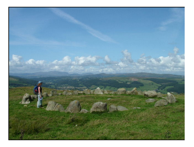
Moel Ty Uchaf Stone Circle

The stone circle is around 12 metres across and is composed of 41 surviving stones which have been set on edge so that most are touching, with a general alternation of a larger stone followed by one or two smaller stones. There are two obvious gaps in the circle, which may be the result of robbing. Inside the circle there is a slight mound up to 5 metres across and 0.3 metres high which has been disturbed, probably by antiquarian investigations. Moel Ty Uchaf is an unusual site which may have had a burial and ritual function. Although it has the appearance of a stone circle, there are also similarities to