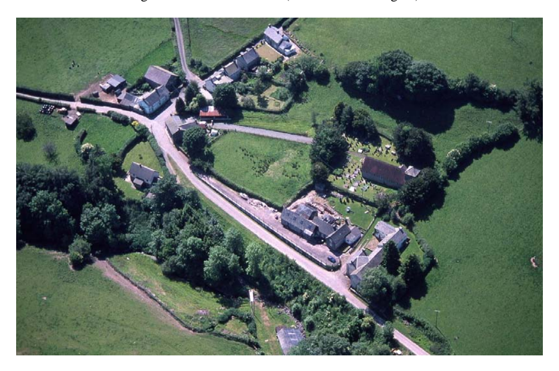
Gwenddwr village, photo 95-C-0358

We have not referenced the sources that have been examined to produce this report, but that information will be available in the Historic Environment Record (HER) maintained by the Clwyd-Powys Archaeological Trust. Numbers in brackets are primary record numbers used in the HER to provide information that is specific to individual sites and features. These can be accessed on-line through the Archwilio website (www.archwilio.org.uk).