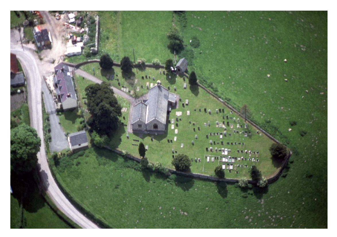
Bryneglwys Church, photo 95-C-0130

woodwork including pulpit and stall fragments, and a coat-of-arms from the reign of George III. To Samuel Lewis in 1833 it was 'a small edifice, having no claim to architectural notice', an unreasonable observation.