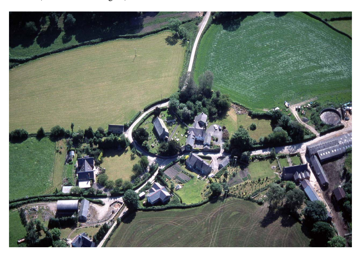
Efenechtyd, photo 95-C-0141

We have not referenced the sources that have been examined to produce this report, but that information will be available in the Historic Environment Record (HER) maintained by the Clwyd-Powys Archaeological Trust. The HER can be accessed on-line through the Archwilio website (www.archwilio.org.uk).