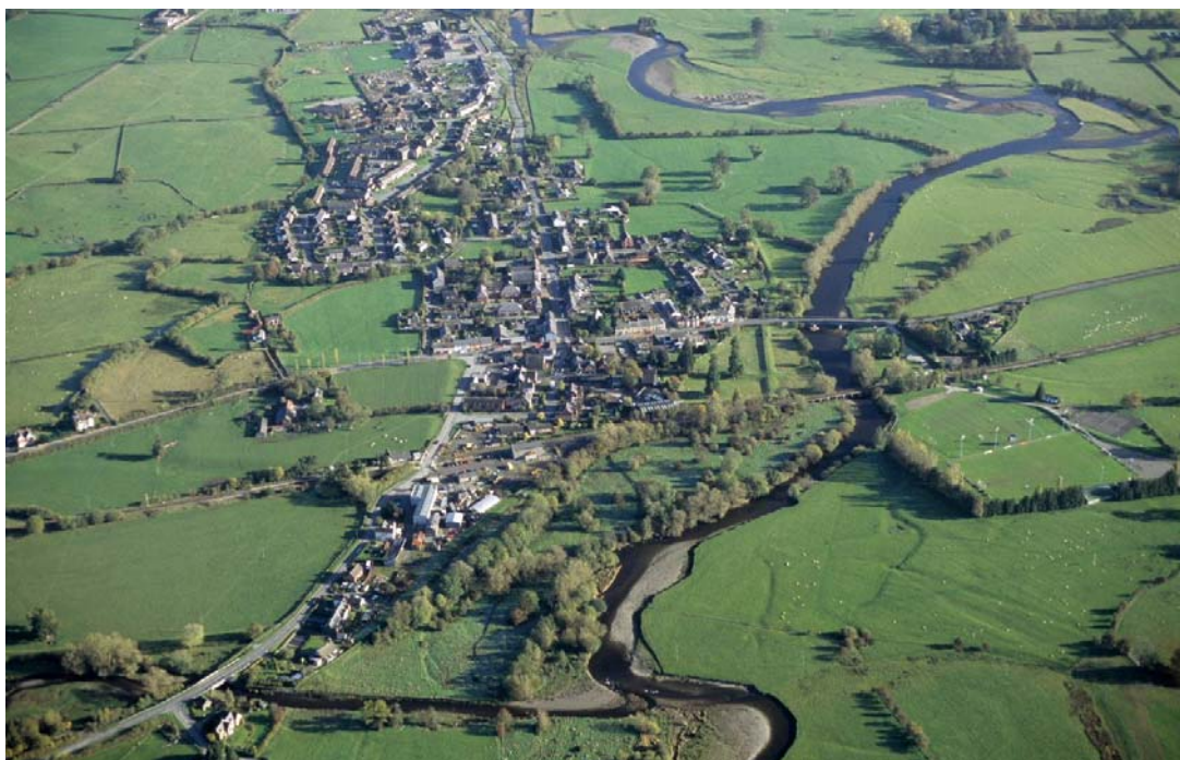
Caersws, photo 06-c-0028, © CPAT, 2012

We have not referenced the sources that have been examined to produce this report, but that information will be available in the Historic Environment Record (HER) maintained by the Clwyd-Powys Archaeological Trust. Numbers in brackets are primary record numbers used in the HER to provide information that is specific to individual sites and features. These can be accessed on-line through the Archwilio website ( www.archwilio.org.uk ).