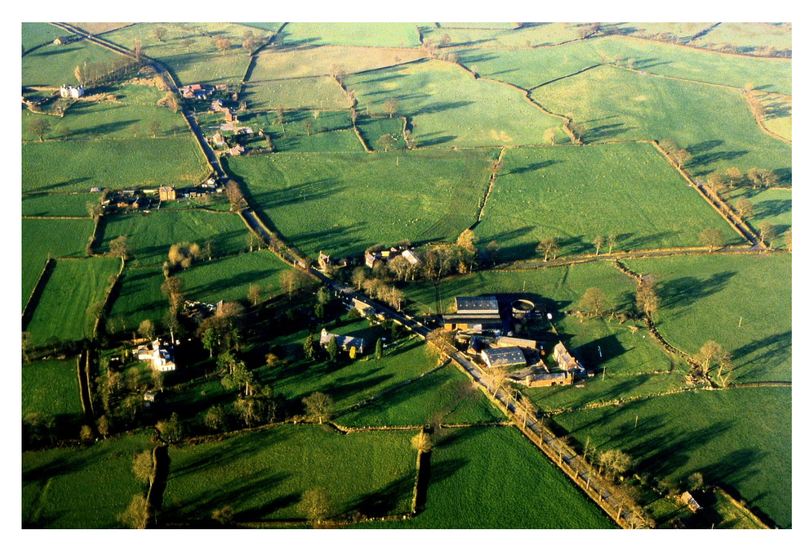
Llandrinio Church, photo 84-c-0524

The church (6418) has a triple dedication to SS Peter and Paul as well as St Trinio, though it has been suggested that the former were only added at the beginning of the 14<sup>th</sup> century. It is now a single-chambered structure and retains some Romanesque architectural features, remnants of what was presumably the first stone building on the site. Much of it was replaced in the later medieval period and the 19th century saw some reconstruction work. There is a Norman font, some 17<sup>th</sup> century wooden furnishings, a west gallery with painted benefaction boards, and two fragments probably from the same early medieval cross-shaft of late 9<sup>th</sup>/early 10<sup>th</sup> century date (6038).