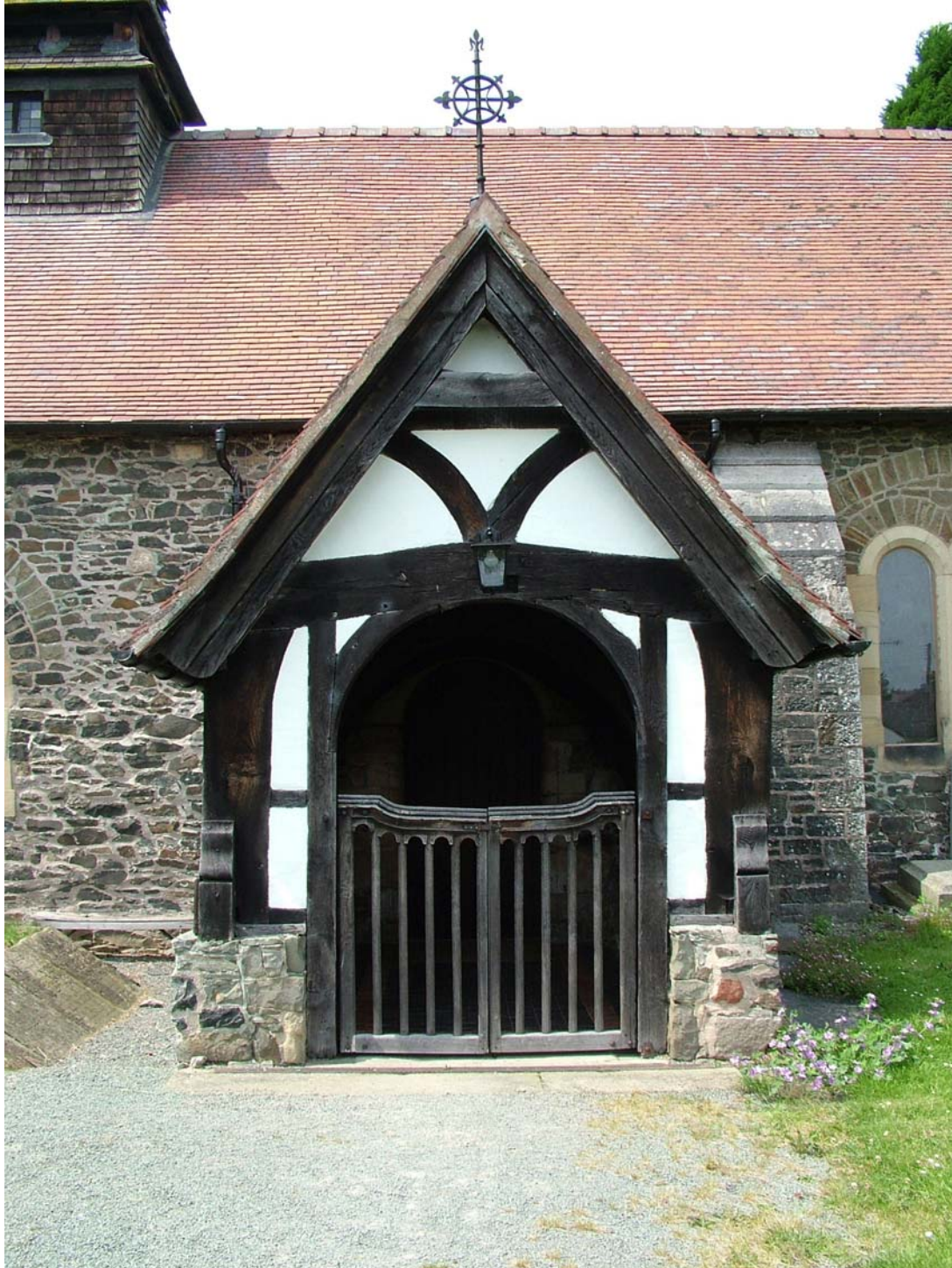
St Garmon's Church, photo 1955-0006