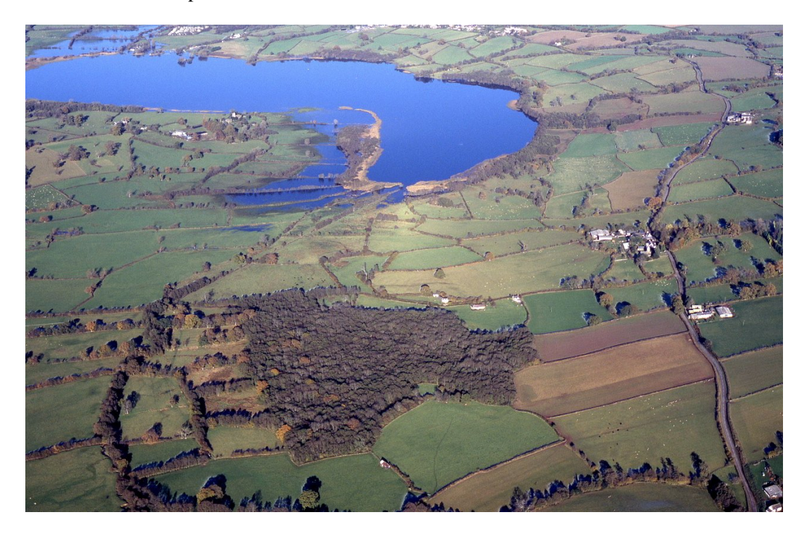
Cathedine, photo 05-c-0074

Faint ridge and furrow – sometimes an indicator of medieval cultivation – is visible in some of the fields around the church, but its date is unclear. Indeed, it is possible that it overlies and is thus later than strip fields of medieval date below the farm.