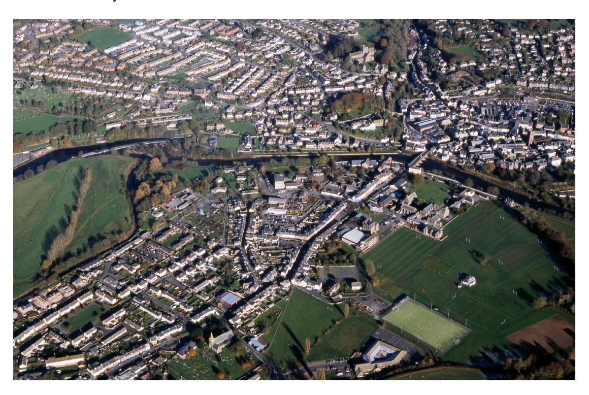
Llanfaes, photo 05-c-0167

1923-5. The only medieval survival is the font and this has been refashioned, and there are some 18<sup>th</sup>-century memorials.