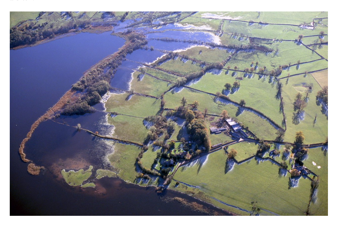
Llangasty, photo 05-c-0068

The shape of the churchyard is polygonal, but with its curving west side, it gives the impression of originally having been more curvilinear, though time has shaved off its other curves. This seems too borne out by geophysical survey in 1993 which reportedly identified a curvilinear feature beneath the eastern churchyard wall which excavation demonstrated to be a ditch.