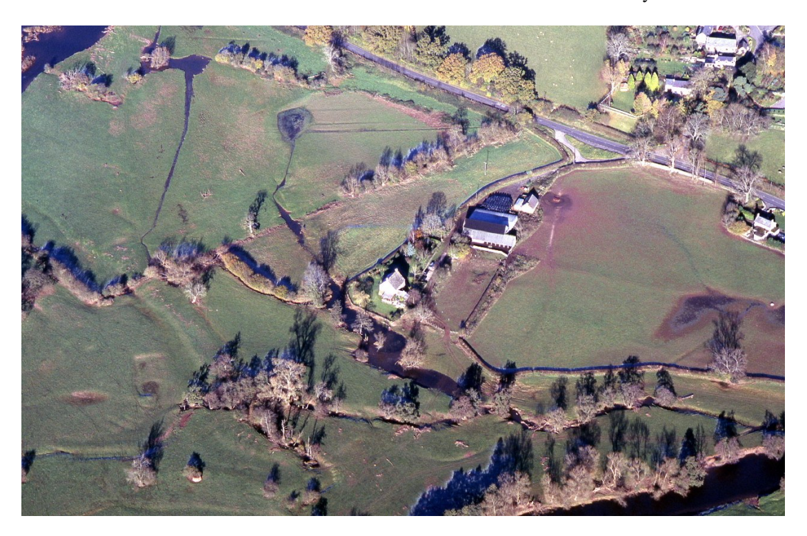
Scethrog, photo 05-c-0103

maps, though an alternative view is that the earthwork represent flood defence features. A barn to the north is considerd to have been first erected in the late 16<sup>th</sup> century.