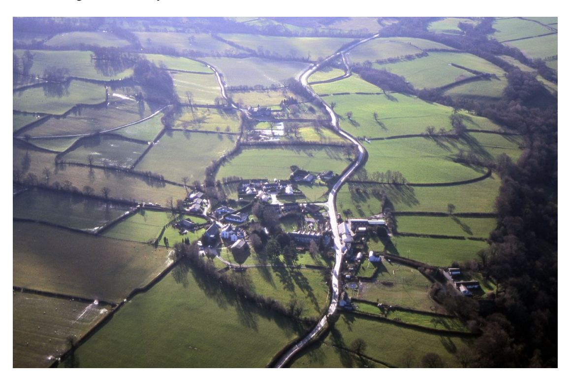
Trefecca, photo 00-c-0176

at Trefecca could simply be a result of this activity from the 18<sup>th</sup> and 19<sup>th</sup> centuries, but the possibility that it reflects an earlier layout associated with the putative medieval hamlet cannot be ignored entirely.