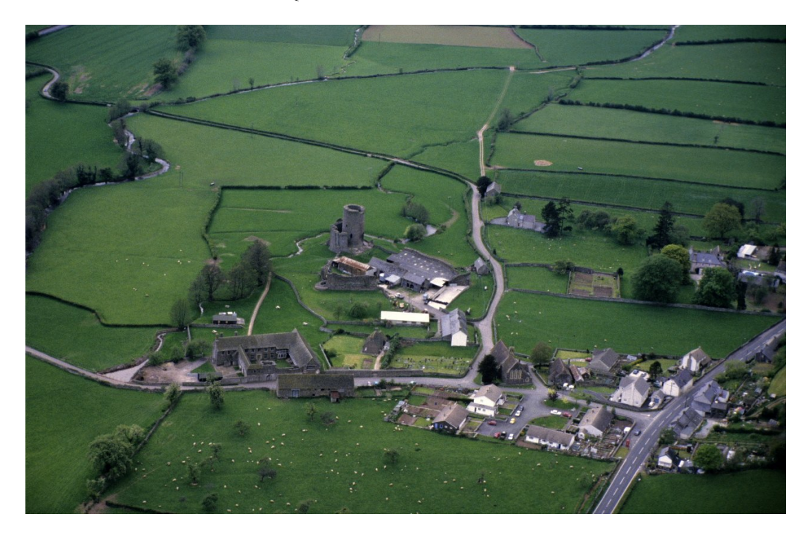
Tretower, photo 87-c-0083 © CPAT, 2013

The village presumably developed only gradually after the Reformation, Leland at that time calling it 'a smaulle village stonding on a little brooke'. It did not become a town in the way that Crickhowell or Talgarth did. Instead it remained small and compact, with little to attract the passing observer whose attention (if Richard Fenton at the beginning of the 19<sup>th</sup> century is a reliable guide) was drawn to the castle and the court. There are probably now fewer houses here than in the time of the first Queen Elizabeth.