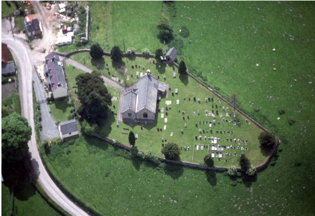
Bryneglwys Church, photo 95-C-0130

woodwork including pulpit and stall fragments, and a coat-of-arms from the reign of George III. To Samuel Lewis in 1833 it was 'a small edifice, having no claim to architectural notice', an unreasonable observation.