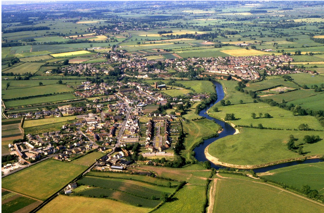
Holt, photo 84-c-0068

The design of the town is extremely regular, and an earlier authority pointed out that in its street plan it bears a resemblance to the true bastide (planted town) of south-western France, with the river bridge at one end of the developed area and the castle and market place at the other.